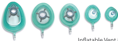
Inflatable Vent Mask