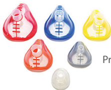
Premium ERGO Mask