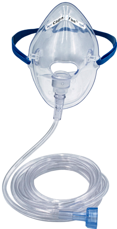
47MSF8-7-6-50 CapnoVue Scope Mask plus EtCO 2 Sample Line

Simplify life in your busy endoscopy lab with the Salter Lab® Blue Series Kits. The CapnoVue® Scope Convenience Kit combines our scope-ready mask with your choice of a standard Luer-Lok® or reflective connector EtCO 2 sample line.